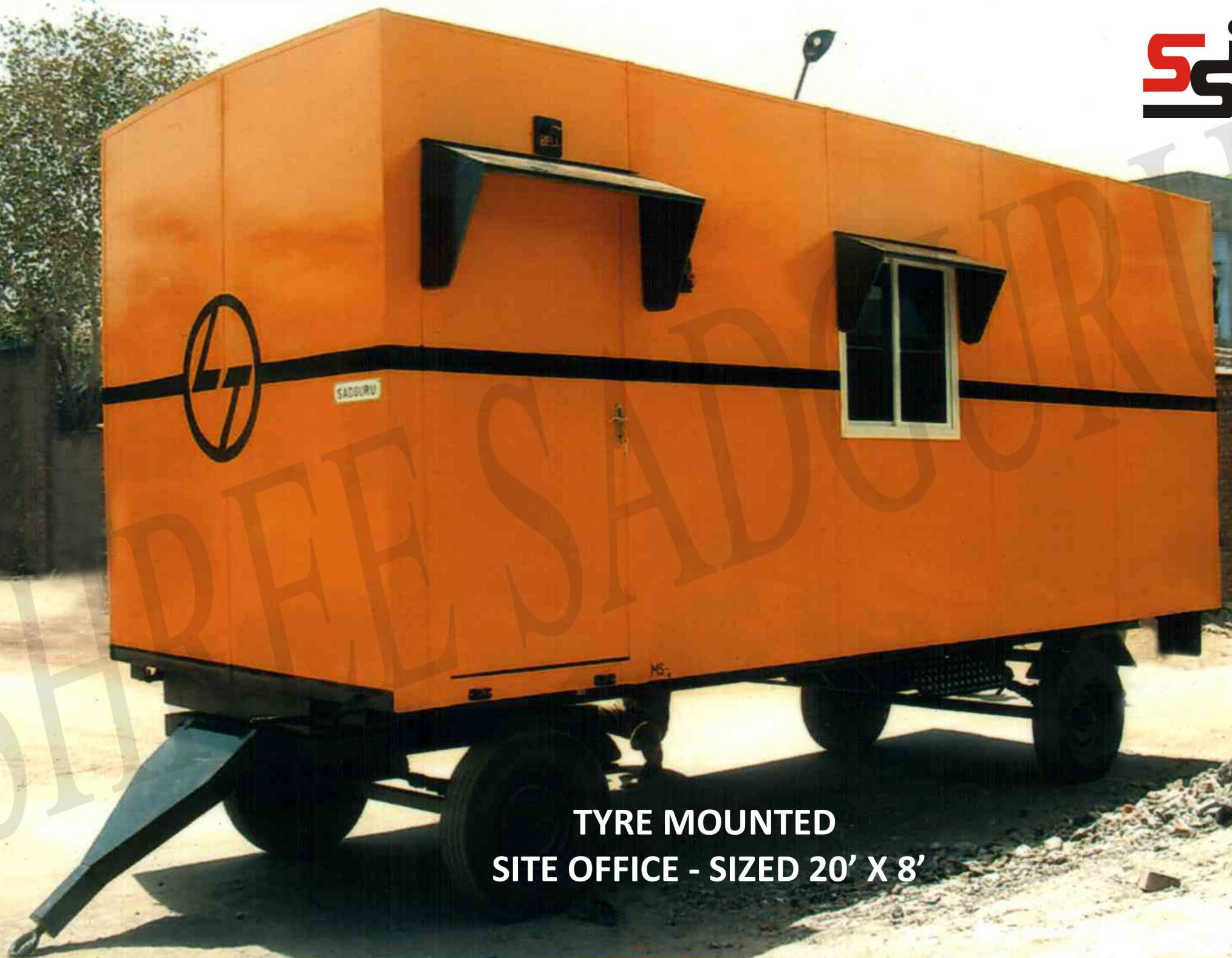
TYRE MOUNTED SITE OFFICE - SIZED 20' X 8'