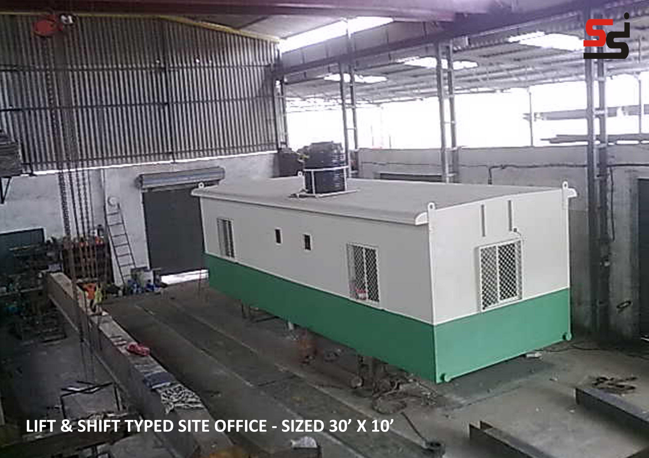
LIFT & SHIFT TYPED SITE OFFICE - SIZED 30' X 10'